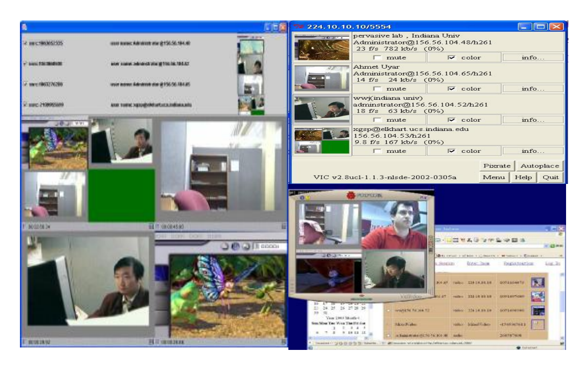
Figure 2 Prototype Demo pictures