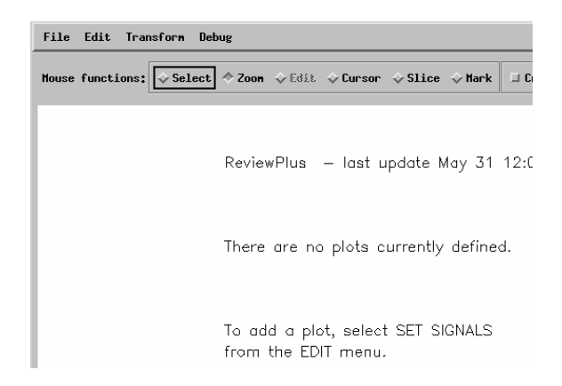
Figure 2. A Part Of The Initial Interface And Display Of ReviewPlus

We begin with the invocation of the collaboration entities, as shown in Figure 2. This corresponds to the start state q_0 of the DFA.