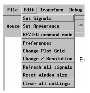
Figure 3. A Sub-menu From The Main Menu Of ReviewPlus

From this interface on the Master client, if we click on the "Edit" item from the main menu, a sub-menu will appear, as shown in Figure 3.