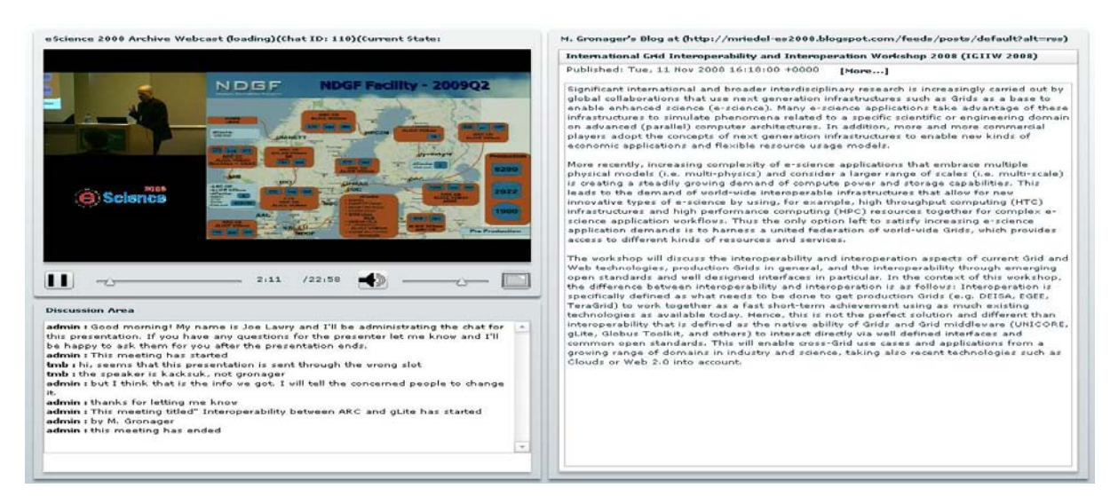
Figure 1. AVATS User Interface showing Video (upper left), Discussion Area (lower left), and Blog (right). The Video Stream includes both the presenter and the slides