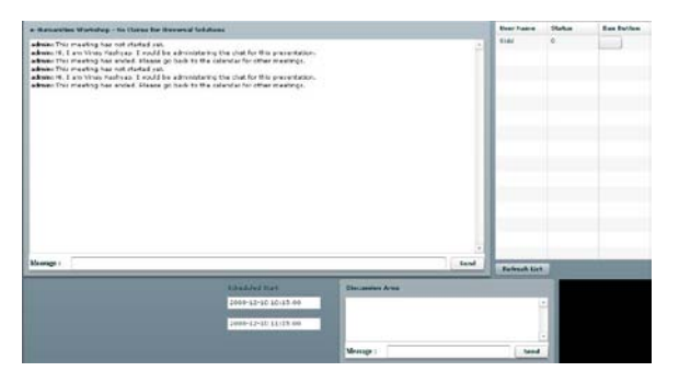
Figure 5. Administration Interface for a Session. See text for a full description.