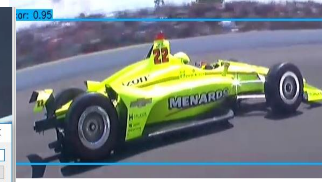
Figure 1.2 Inferred Image

The cars in the images were previously labelled as all sorts of objects other than a car. The cars now are labelled as cars as the system is being trained that these are cars. Figure 1.1 is a shot of the labeling tool used to label the cars. There is a YOLOv3 format and Pascal VOC format and we choose YOLOv3 to use. Figure 1.2 is the inferred images ran through the tool after the other pictures have been converted and used to train that data. The probability of a racecar being detected as a car increases as the system is continuously trained.