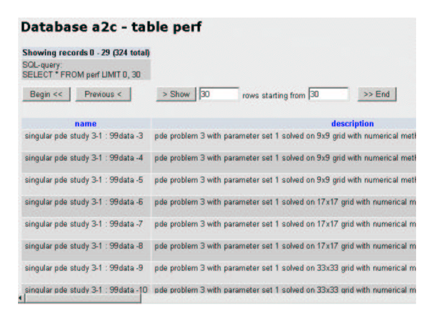
Figure 3: End-user interface for browsing the performance database.

represent values that quantify the distinguishing characteristics of the collection of methods (speed of execution, accuracy, scalability, etc.) and include all important measures for evaluating which methods are better than others for a given benchmark problem. The benchmark features represent the interesting and important characteristics of problems that scientists are interested in solving. As far as possible, the collection of methods should be applied to all the benchmark problems and the measures should be collected across all applications of the methods (Statistical pre-processing techniques can help overcome any lack of coverage for the underlying problem population). It remains the task of the domain expert to assemble the benchmark problems and the collection of methods, and to identify the salient, relevant features of both problems and methods. Performance measures should capture the significance of altered problem features on method execution.