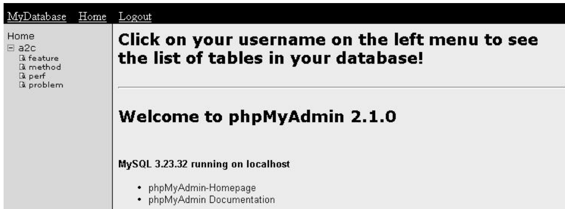
Figure 1: MyPYTHIA database homepage for creating the database, importing performance data, and creating records which identify the benchmark problems, the collection of methods, and the features of interest.

The list of features and their values are the essential structures required in the analysis of the benchmark population.